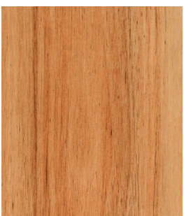
Tas. Oak FL -2008/FL-1208