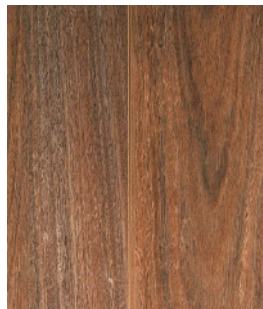
Spotted Gum FL-2001/FL-1201