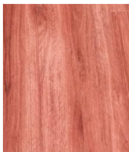
Sydney Blue Gum FL-1211

*Photos are for illustration only, colour may vary to the actual product.