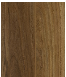
Brush Box FL-2006/FL-1206