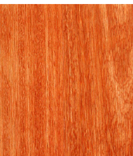
Kempas Light FL-1210