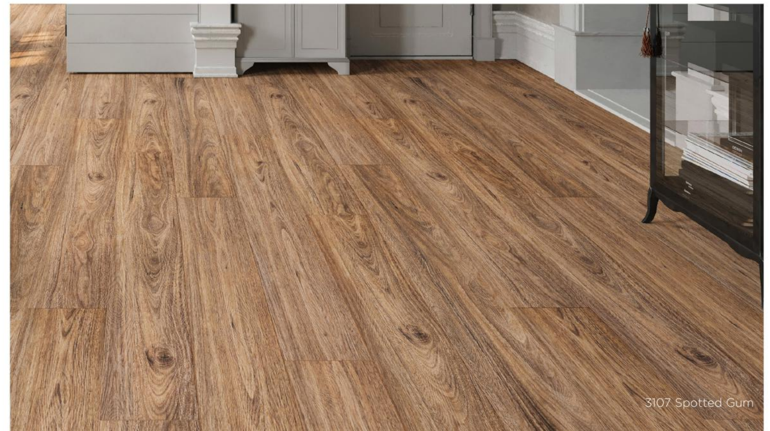
3107 Spotted Gum