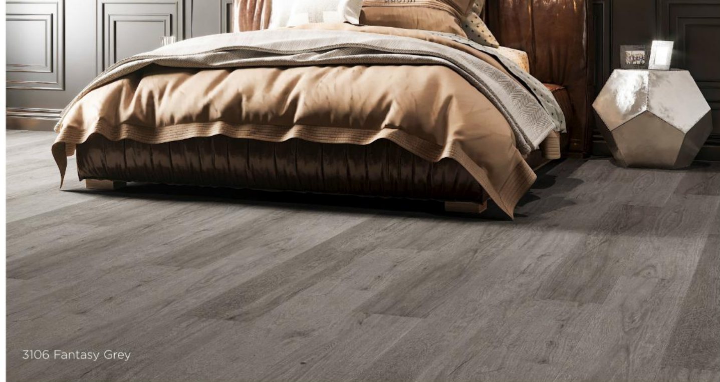
3106 Fantasy Grey